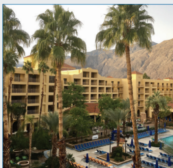
The Renaissance Palm Springs is scheduled to undergo a complete renovation that will begin this June.

indoor and outdoor meeting space. In the works is a new, 1,175-square-foot terrace located right outside of the Sago Ballroom, which can accommodate groups of up to 300 people.