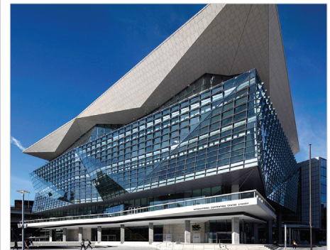
International Convention Centre Sydney

The International Convention Centre Sydney (ICC Sydney) has opened in the heart of its own harbor waterfront pre-